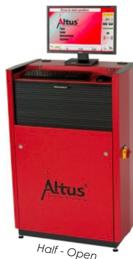
Half - Open