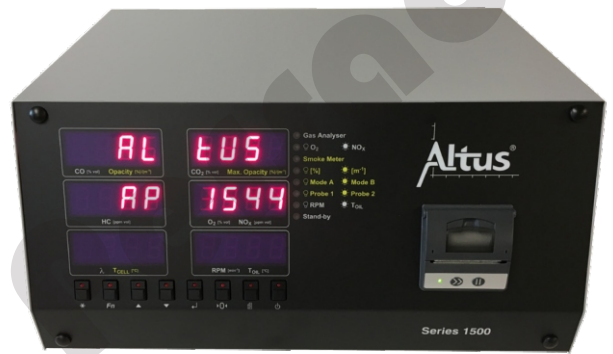
AP1544 Gas Analyser