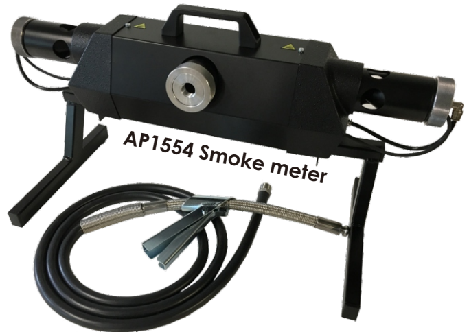
AP1554 Smoke meter